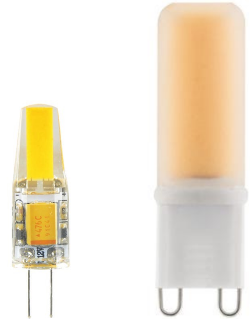
White Ceramic Base