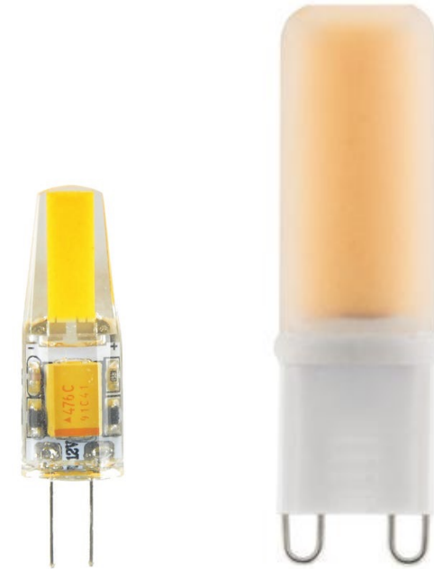
White Ceramic Base